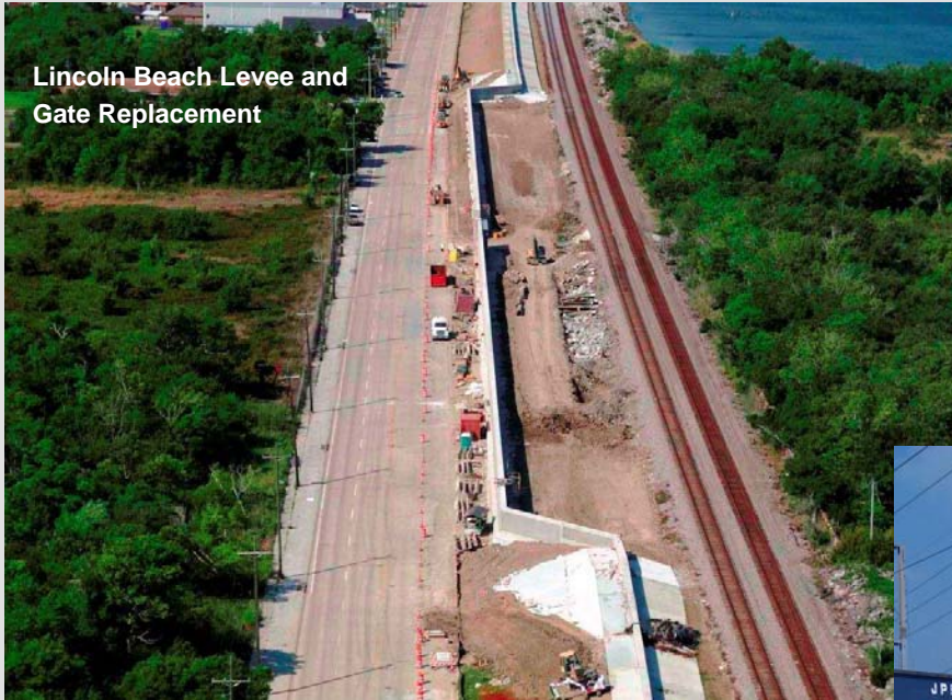
Lincoln Beach Levee and Gate Replacement

Small Business Contractor: Shavers-Whittle Construction HSDRRS Project: Lincoln Beach Levee and Gate Replacement