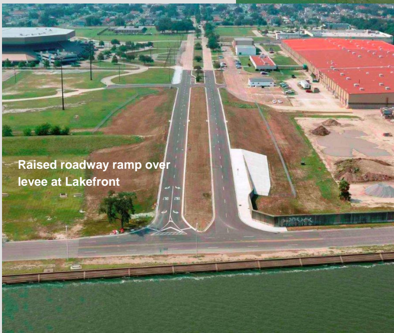
Raised roadway ramp over levee at Lakefront

Small Business Contractor: L&A Contracting Co. HSDRRS Project: Citrus Lakefront Levee