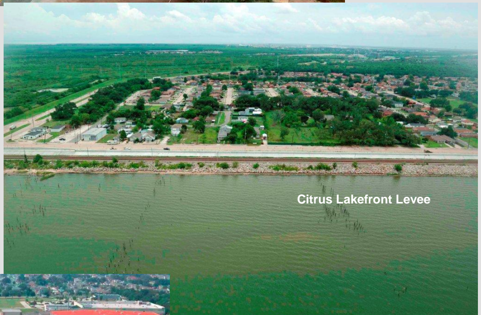
Citrus Lakefront Levee

Small Business Contractor: Integrated Pro Services LLC HSDRRS Project: Chalmette Loop Levee and Floodgates