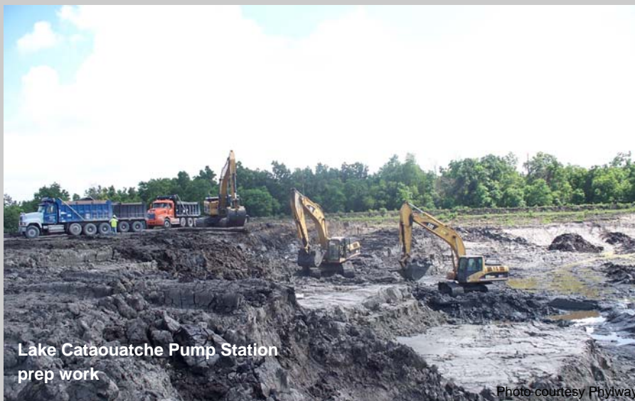
Lake Cataouatche Pump Station prep work

Small Business Contractor: Phylway Construction Co. HSDRRS Project: Lake Cataouatche Pump Station