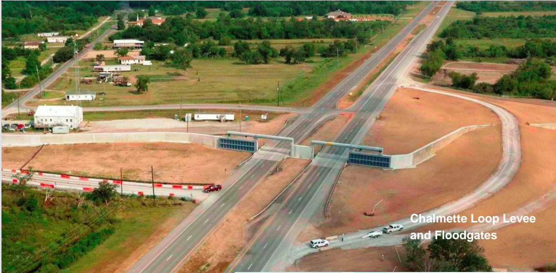
Chalmette Loop Levee and Floodgates

Small Business Contractor: Integrated Pro Services LLC HSDRRS Project: Chalmette Loop Levee and Floodgates