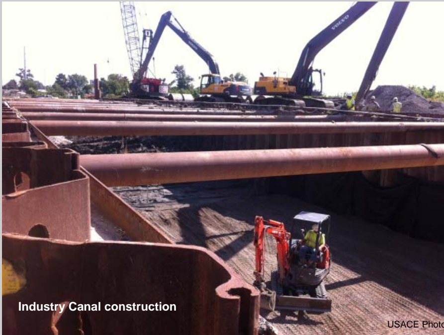
Industry Canal construction

Status Report Newsletter Task Force Hope Strategic Communications 7400 Leake Ave., Room #388 New Orleans, LA 70118 (504) 862-1949