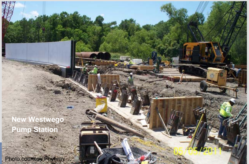
New Westwego Pump Station